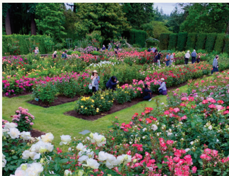
Portland International Rose Test Garden

Oregon's fertile Willamette Valley is bursting with public gardens, nurseries and horticulture. Nursery and greenhouse products are Oregon's #1 agriculture commodity, so the countryside is fascinating to explore. Many of the growers welcome the public and have incredible display gardens you can wander, including Sebright Gardens , Wooden Shoe Tulip Farm , Adelman's Peony Gardens , Schreiner's Iris Gardens , and Swan Island Dahlias . Located in Silverton, The Oregon Garden is an 80-acre paradise packed with experiences for the entire family. Adjacent is The Oregon Garden Resort , a charming lodge-style hotel and events center. The Allison Inn & Spa offers a luxurious experience, surrounded by gardens and vineyards.