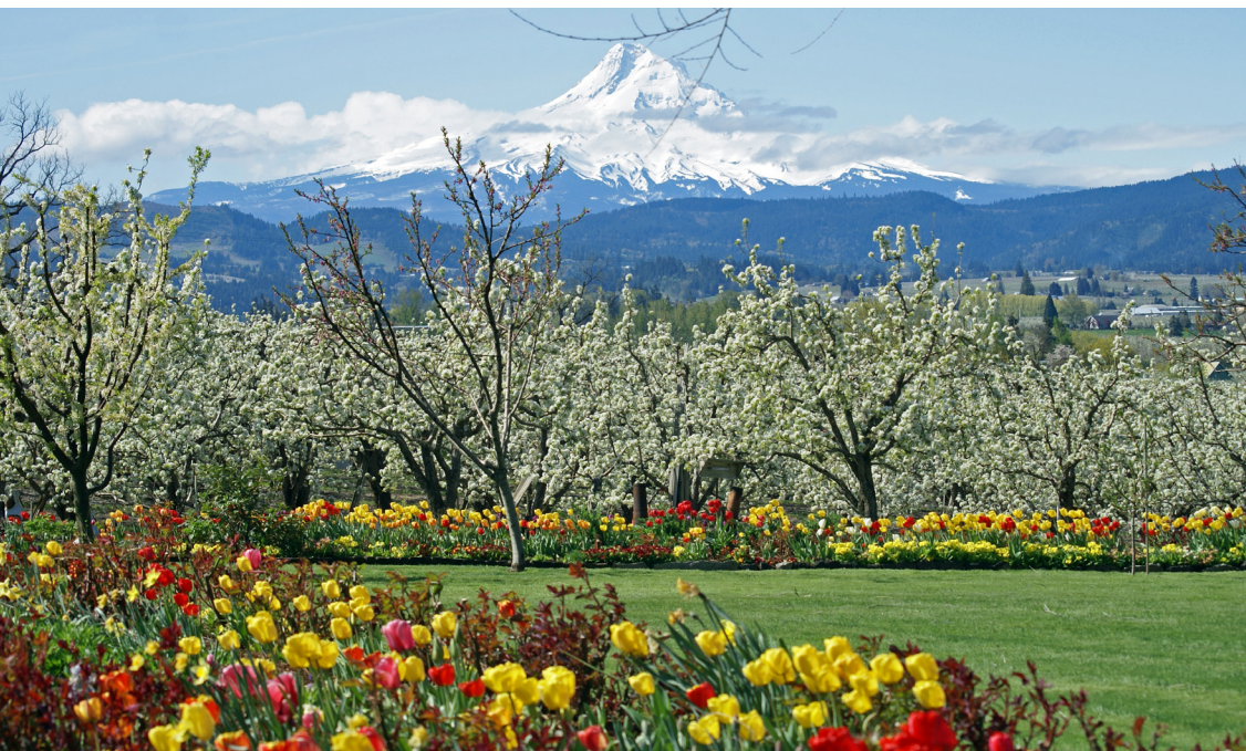
Wooden Shoe Tulip Festival