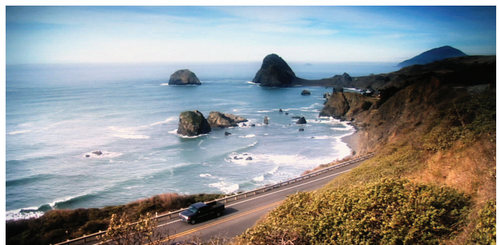
Famous Sea Stacks of the Oregon Coast

This tour covers approximately 363 miles (584 kms) and is meant to be enjoyed over 6 days. For more suggestions or assistance please contact us!