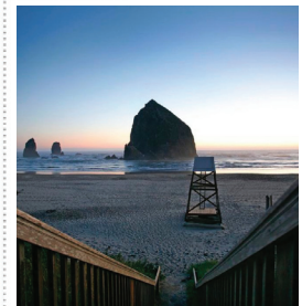
Haystack Rock in Cannon Beach

Enjoy the Oregon Coast from A to B ... Astoria to Brookings and all the wonderful towns in-between. Contact any of our regional specialists and we'll customize your experience.