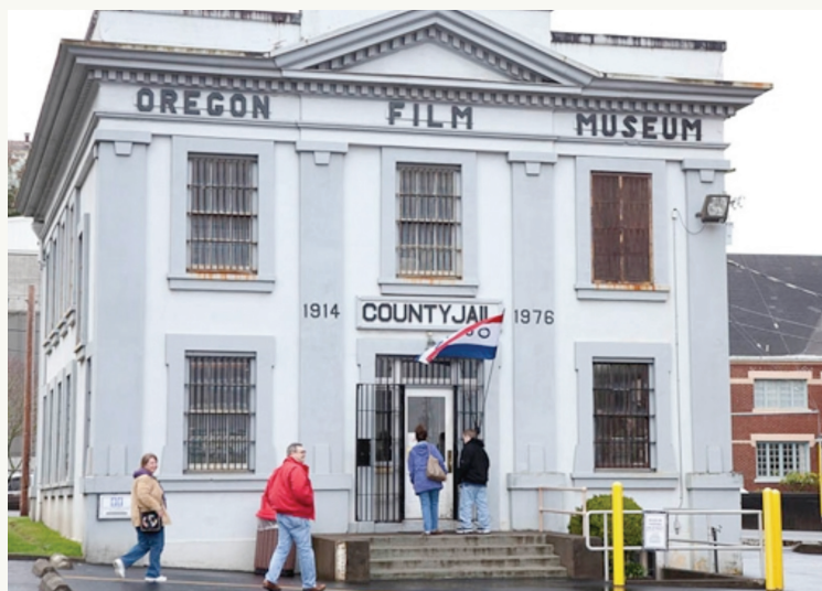
Oregon Film Museum (Astoria)