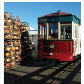
Astoria Trolley "Old 300"

Enjoy all the unique experiences that Oregon has to offer – From cowboys, to rose gardens, to beaches and everything in-between. Contact any of our regional specialists and we'll customize your visit.