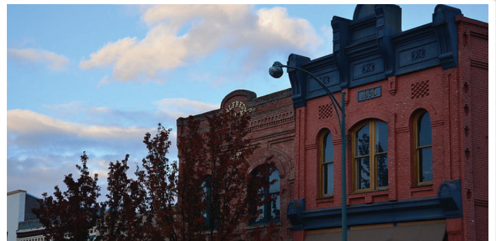
Historic Baker City

This tour covers approximately 630 miles (1010 kms) and is meant to be enjoyed over 7 days. For more suggestions or assistance please contact us!