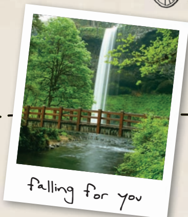
falling for you