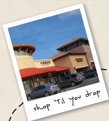
shop 'til you drop