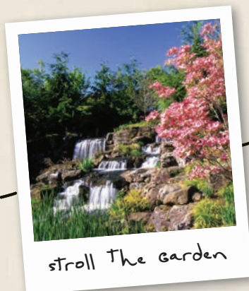
stroll the garden

(local cuisine + wine pairings + Oregon Truffles = Yum!)