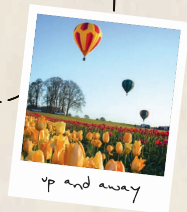
up and away